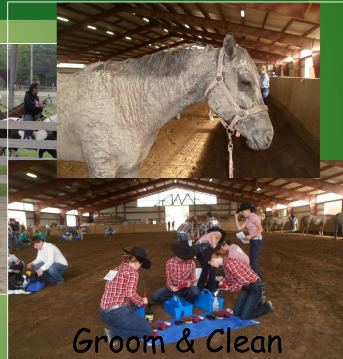
Groom & Clean