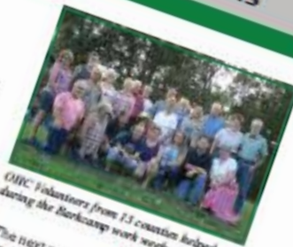
OHC Volunteers from 13 counties helped during the Merikamp work week.